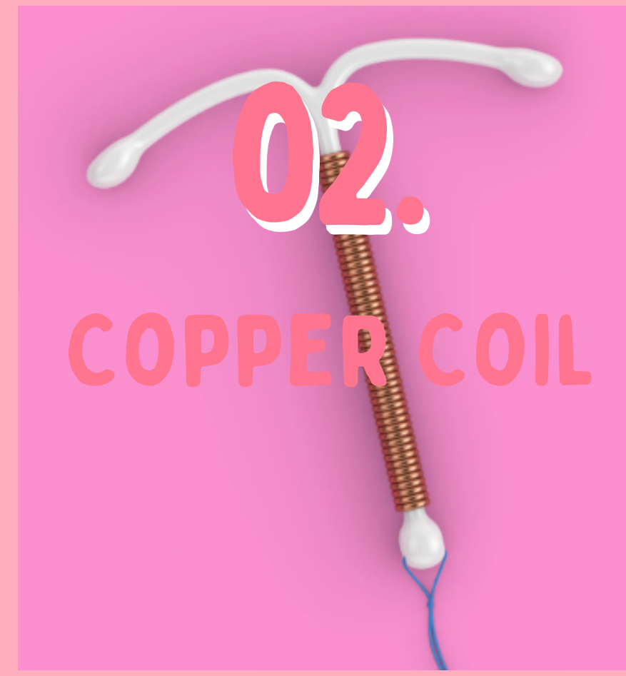
02. COPPER COIL